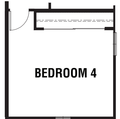
OPTIONAL BEDROOM 4 ILO LOFT