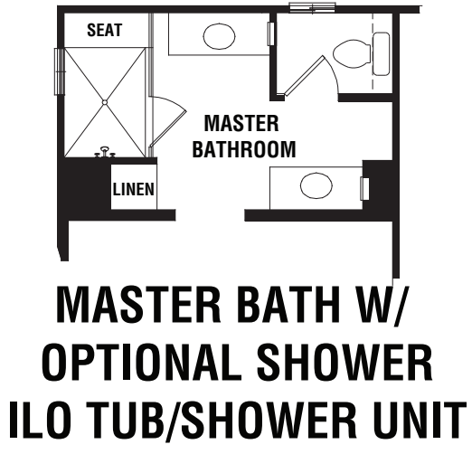
MASTER BATH W/ OPTIONAL SHOWER ILO TUB/SHOWER UNIT